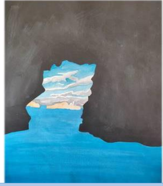
'Blue Silhouette' by Sashimong Aier, XII