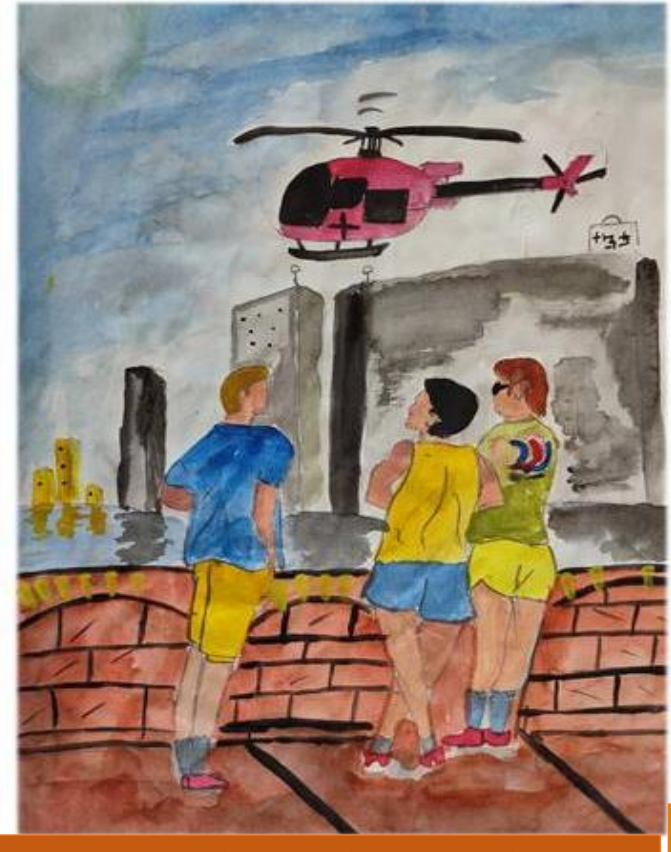
'Cityscape' by Aastik Aggarwal, XII